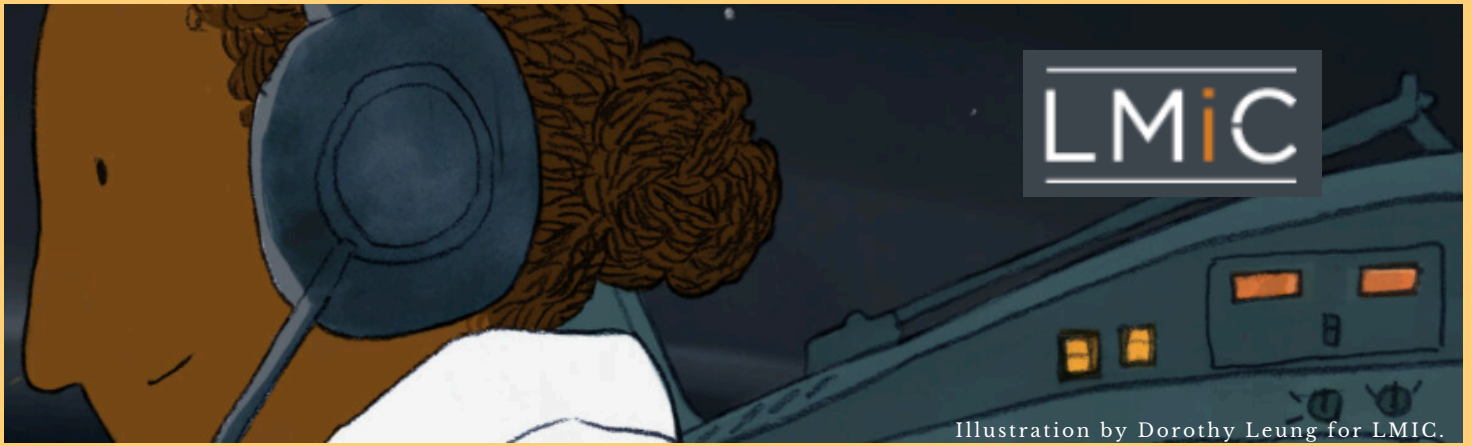
Illustration by Dorothy Leung for LMIC.

Understanding the relationships between skills gives us insights into the needs of the labour market and the complexities of understanding skill demands. This report demonstrates how online job postings serve as a valuable source of labour market information that can be used to better understand the relationships between skills and to highlight trends in skill demands.