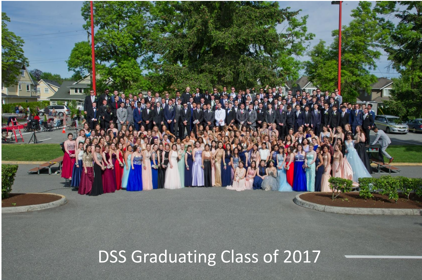
DSS Graduating Class of 2017